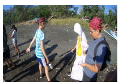
August 27th - 30th 2019

Tanjung Budaya Campsite, Pemuteran, Buleleng - Bali