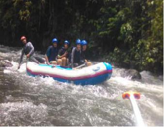
August 27<sup>TH</sup> - 30<sup>TH</sup> 2019

Seked Batur Natural Hot Spring Campsite, Toya Bungkah, Batur - Bali